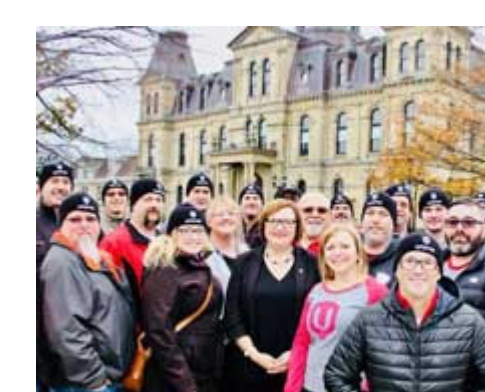
Unifor stands in firm solidarity with New Brunswick public sector workers and their unions amid the Higgs government's antiworker, anti-labour legislation to amend the Public Service Labour Relations Act.