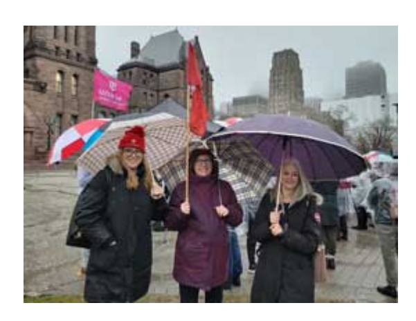
Nov. 30 was the National Day of Action for Child Care and Unifor demanded better wages for Early Childhood Educators at rallies in Toronto and Halifax. See the video now.